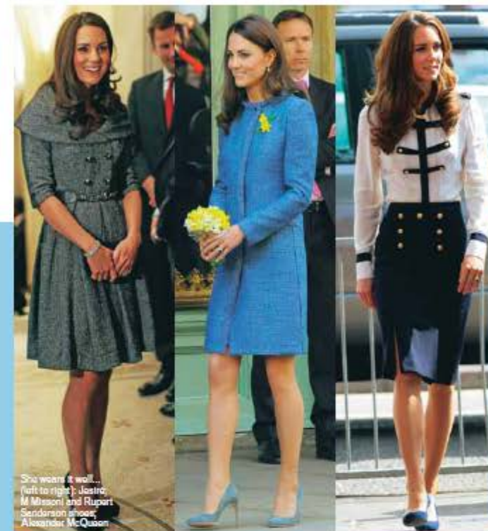
She wears it well... (left to right): Jostin, M. Missoni and Rupert Sanderson shoes; Alexander McQueen