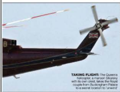
TAKING FLIGHT: The Queen's helicopter, a maroon Sikorsky with its own pilot, takes the royal couple from Buckingham Palace to a secret location to 'unwind'

with excitement after their marriage ceremony which was both an intimate family affair and a global event televised across the world.