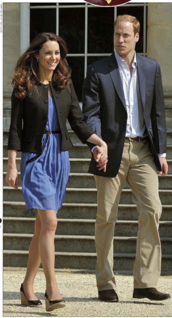
HAND IN HAND: The new Duke and Duchess of Cambridge take a brief stroll in the Buckingham Palace gardens yesterday